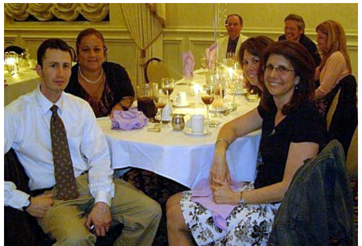
Members from John Jay