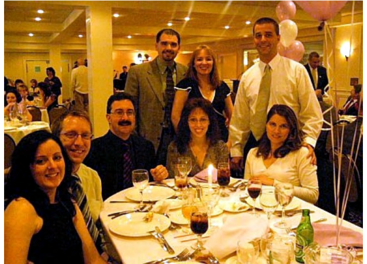
Members from Fishkill Elementary