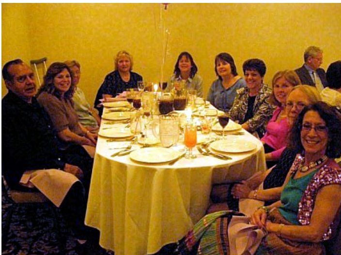
Members from Van Wyck - table 1