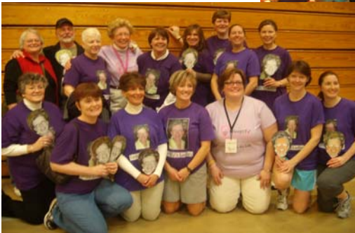
Left: past and present Oak Grove faculty, staff and principals)

National Association of Letter Carriers, AFL-CIO