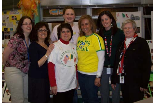
(Van Wyck Foreign Language Department)