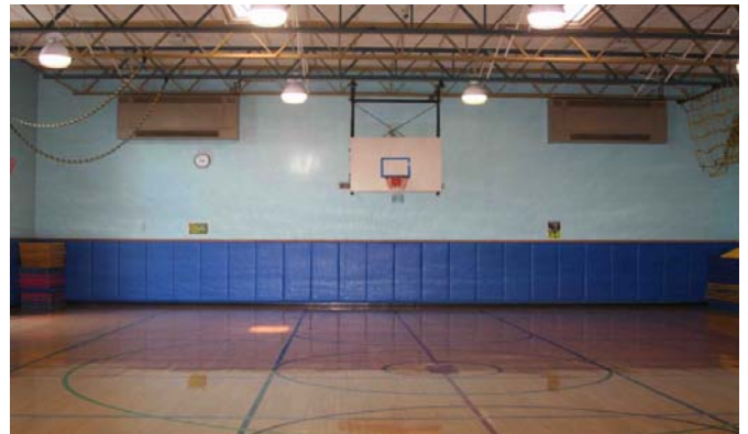
(Top picture: Sheafe Road Gym before. Bottom picture: Sheafe Road Gym after)

Eat Well Play Hard (EWPH) was developed to help prevent childhood obesity and reduce long-term risks for chronic disease through the promotion of targeted dietary practices and increased physical activity. The EWPH “Seed Projects” were developed in order to facilitate permanent, sustainable change to a school’s policy, system or the physical environment in order to increase physical activity and change that will outlast the funding awarded.