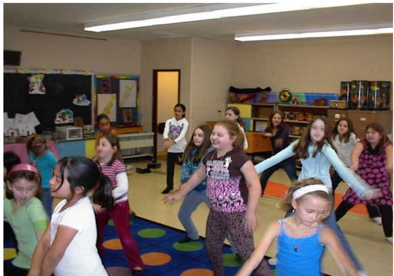
(One of the Brinckerhoff Clusters working on a dance routine.)

This is a pilot year for Brinckerhoff as this is the first time that all students (grades 1-5) and teachers have been involved in clusters. While teachers learn to “embrace their inner cluster,” students are loving it! Clusters range from dance and photography to winter sports, scrapbooking, baking, poetry, and even pasta. It is an exciting opportunity for teachers and students alike, to explore topics that are generally not a part of the everyday academia while applying New York State Learning Standards to real life situations.